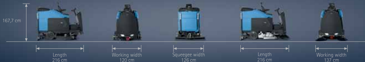
SMg130 (Base) - SMg130